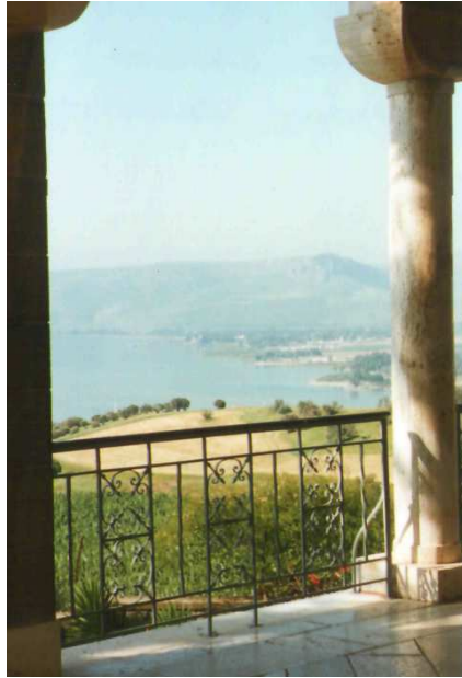
The Sea of Galilee