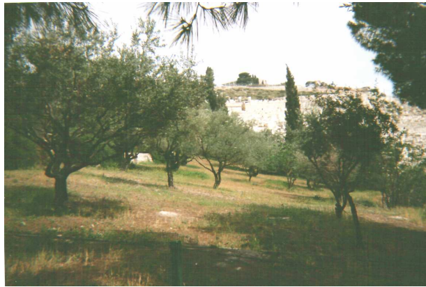
The Garden of Gethsemane