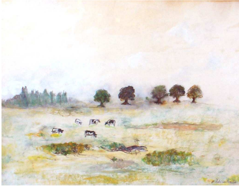
Enrique Policastro (1898-1971): Ombúes ( private collection )